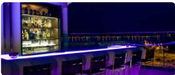
RESTAURANT CUM BAR